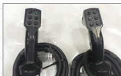
Joystick control kit